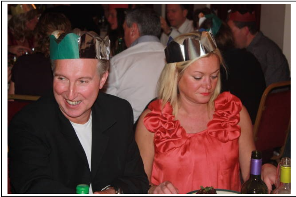
Tim Cook and his better half!