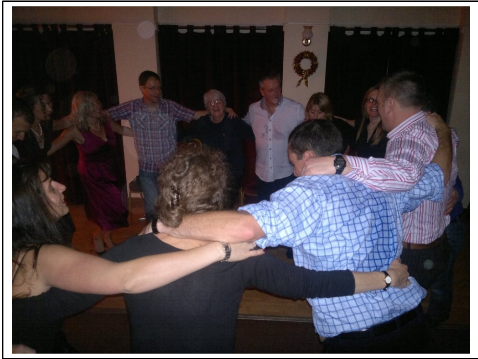
The CRC Oakey Coakey!

It was then onto the disco afterwards until midnight, where the dance floor was alive some nifty (and some not so nifty) footwork!